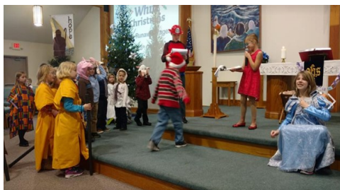
Another photo from the BOLT Christmas Program!