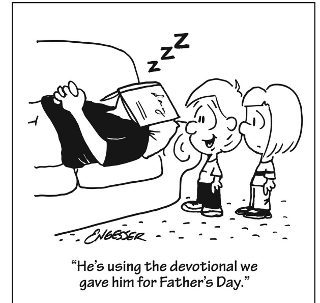
"He's using the devotional we gave him for Father's Day."