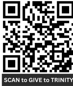
SCAN to GIVE to TRINITY

Budgeted Income: $15,629 Actual Income: $15,752 Budgeted Expenses: $17,063 Actual Expenses: $13,973