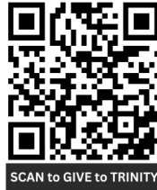
SCAN to GIVE to TRINITY

YTD Numbers: Income: $154,398 Expenses: $162,011 Income Less Expenses: -$7,613