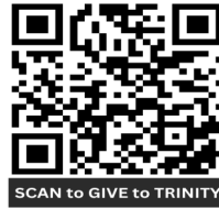
SCAN to GIVE to TRINITY

Ushers: Acolyte: Readers: Power Point: Sound/Video Tech: