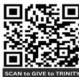
SCAN to GIVE to TRINITY