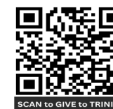
SCAN to GIVE to TRINITY